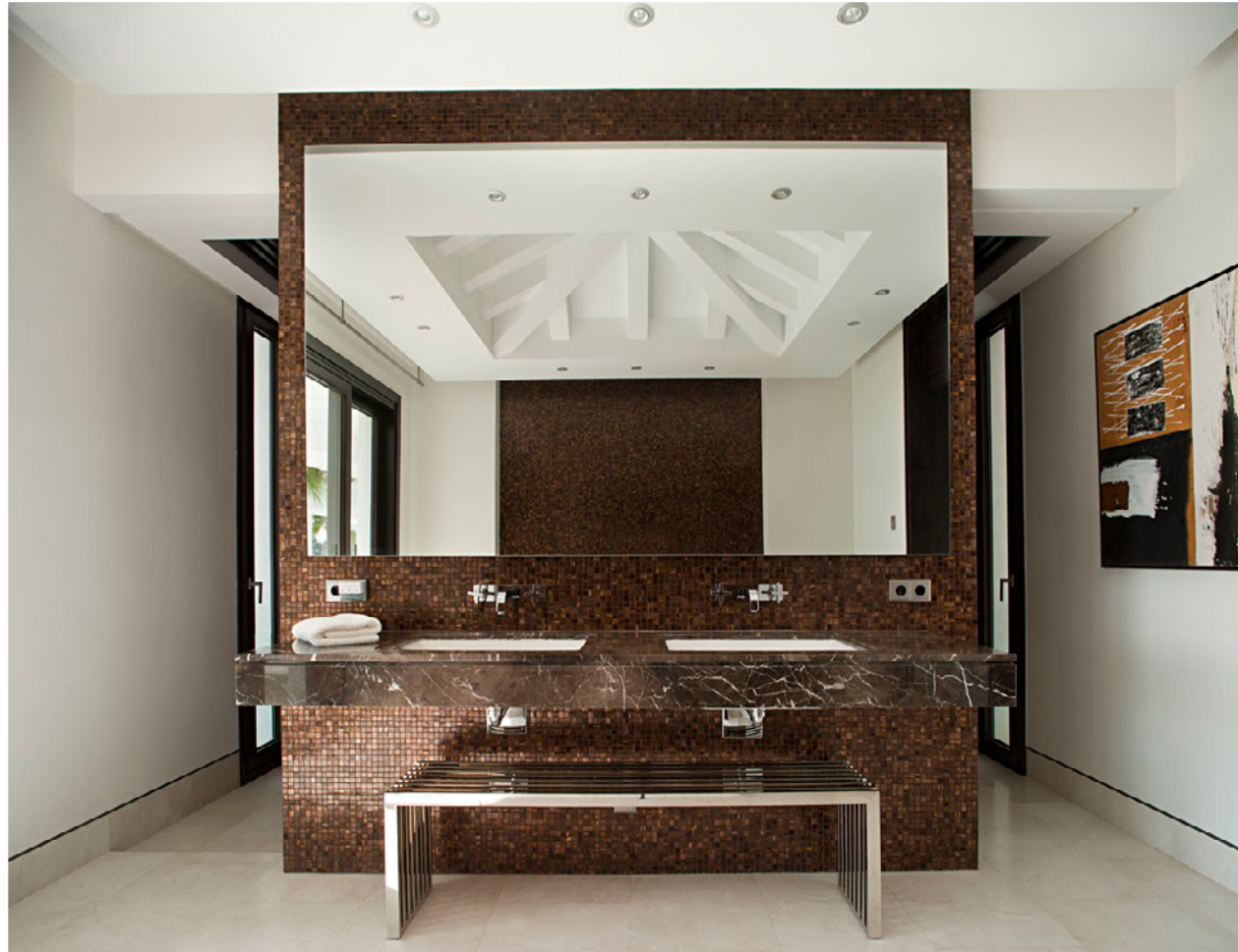
TINO VILLAS PORTFOLIO