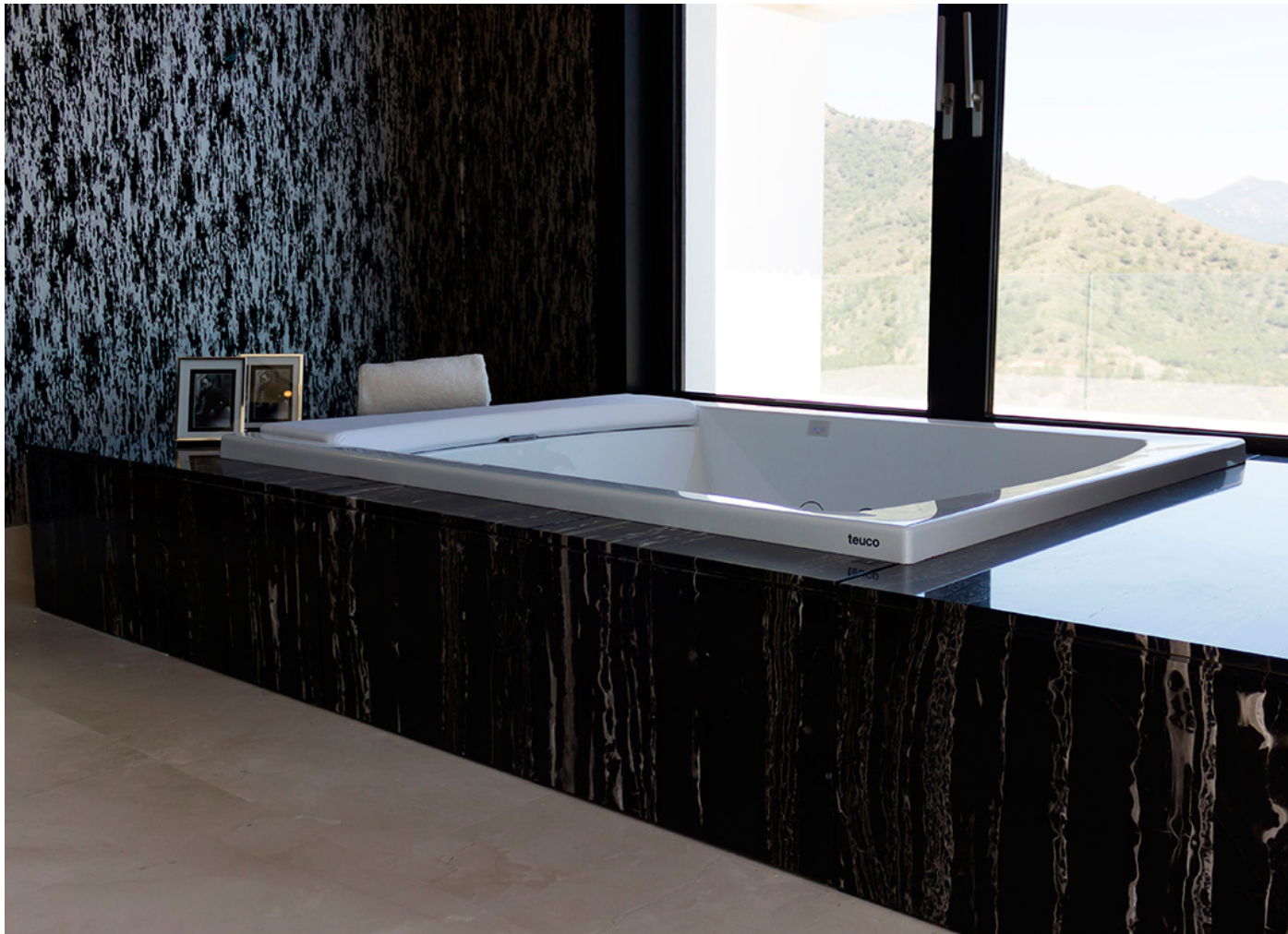
TINO VILLAS PORTFOLIO