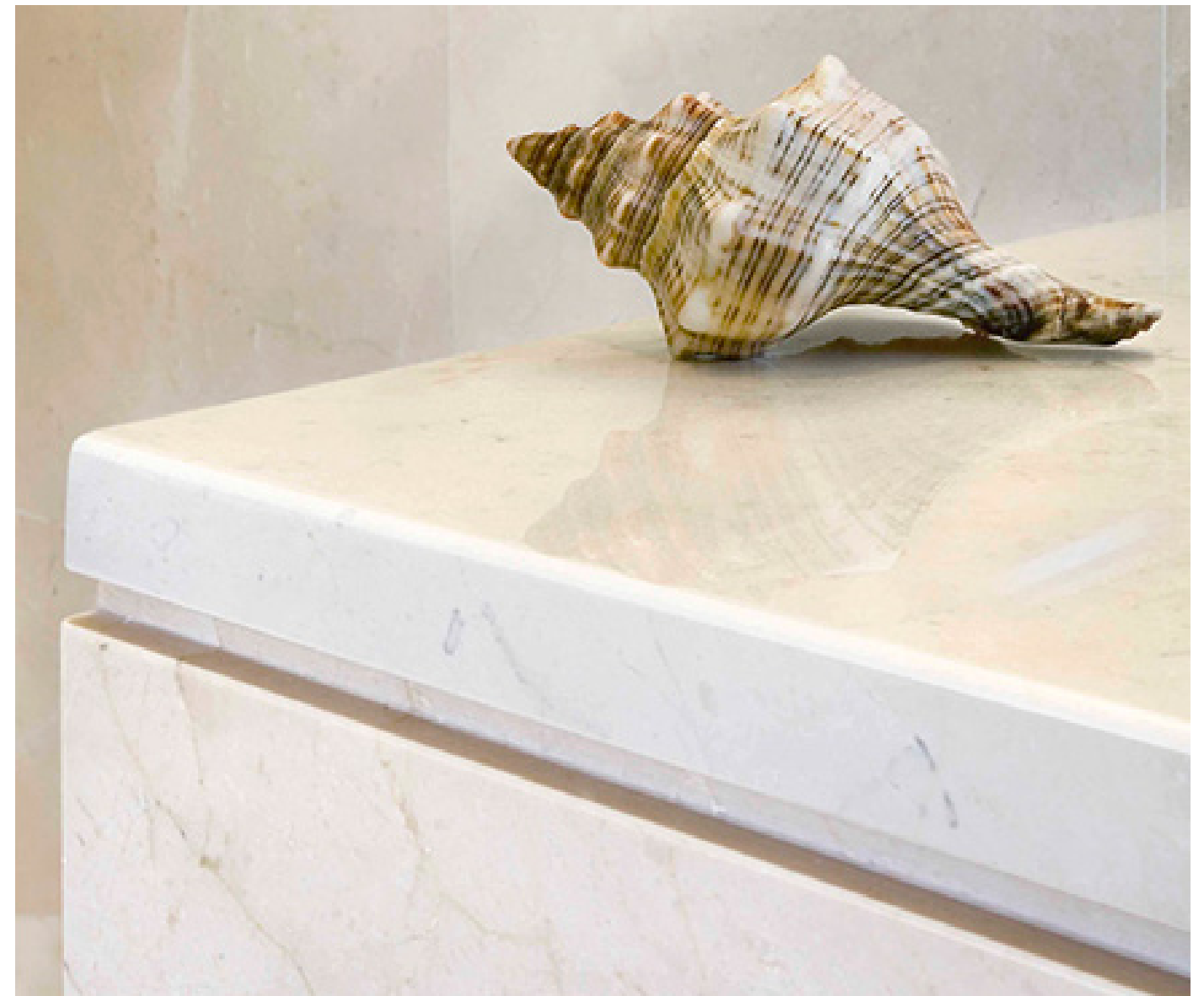
TINO VILLAS PORTFOLIO