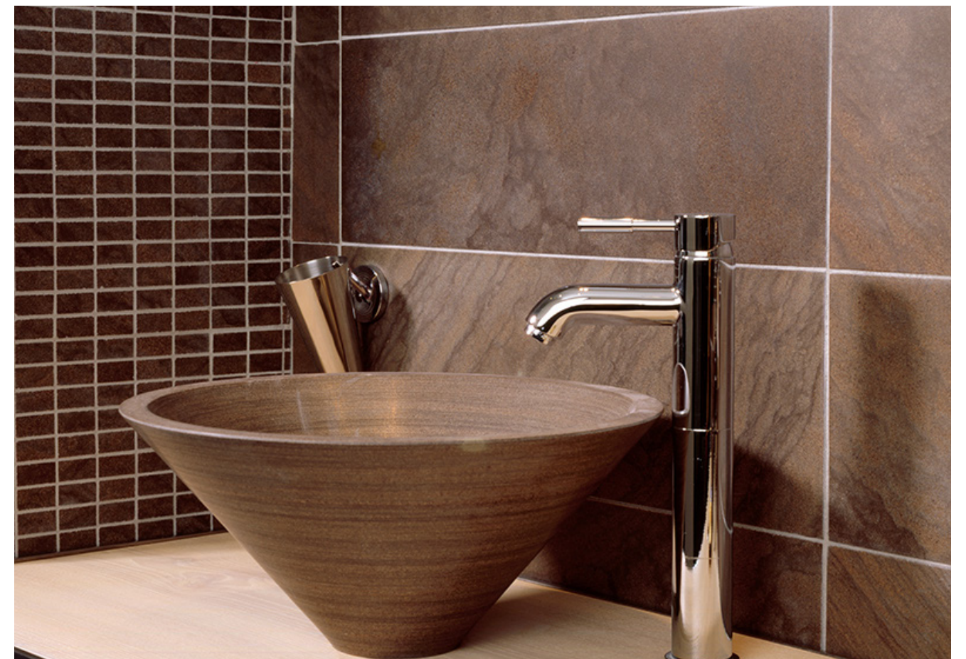
TINO VILLAS PORTFOLIO