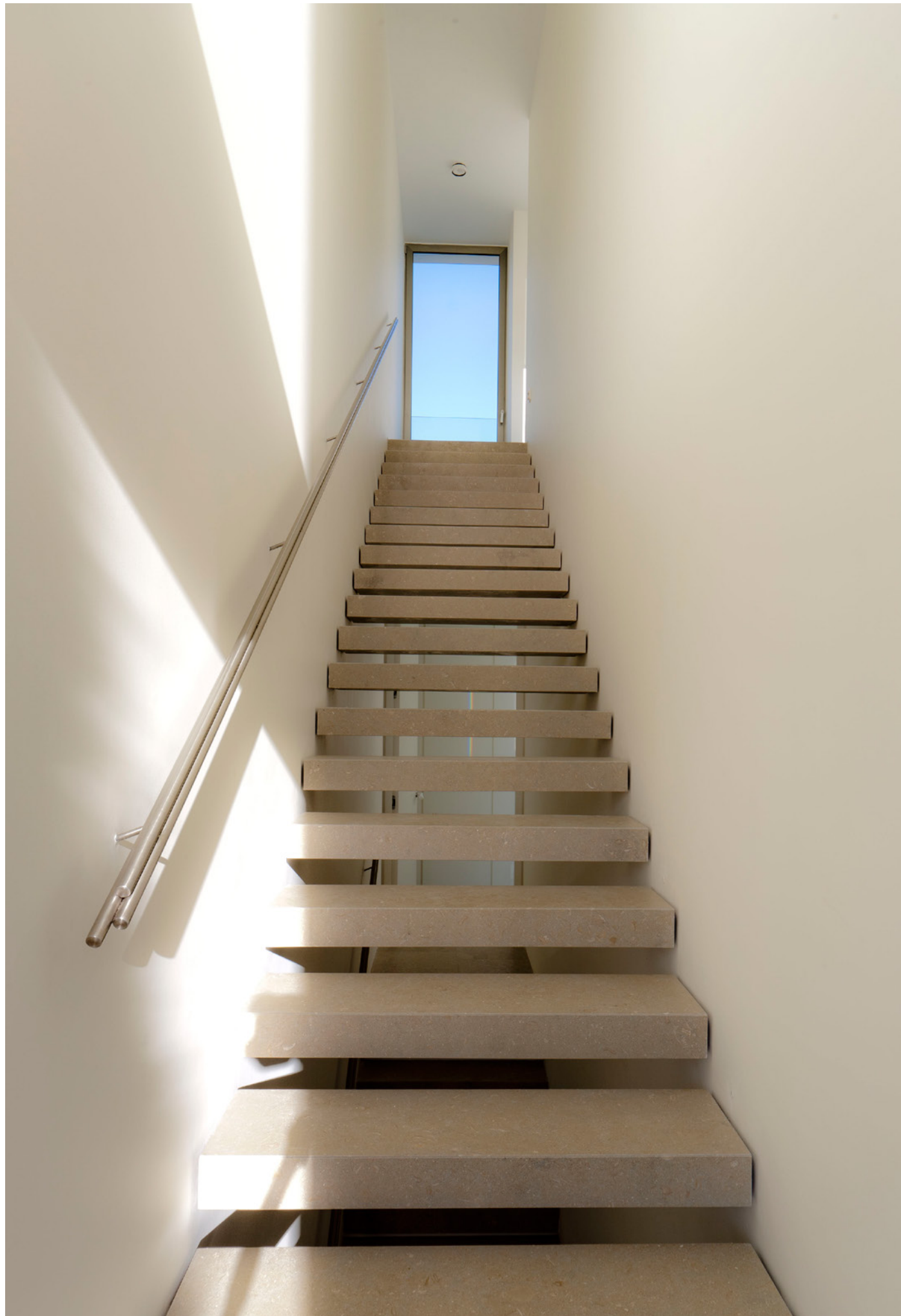
TINO VILLAS PORTFOLIO