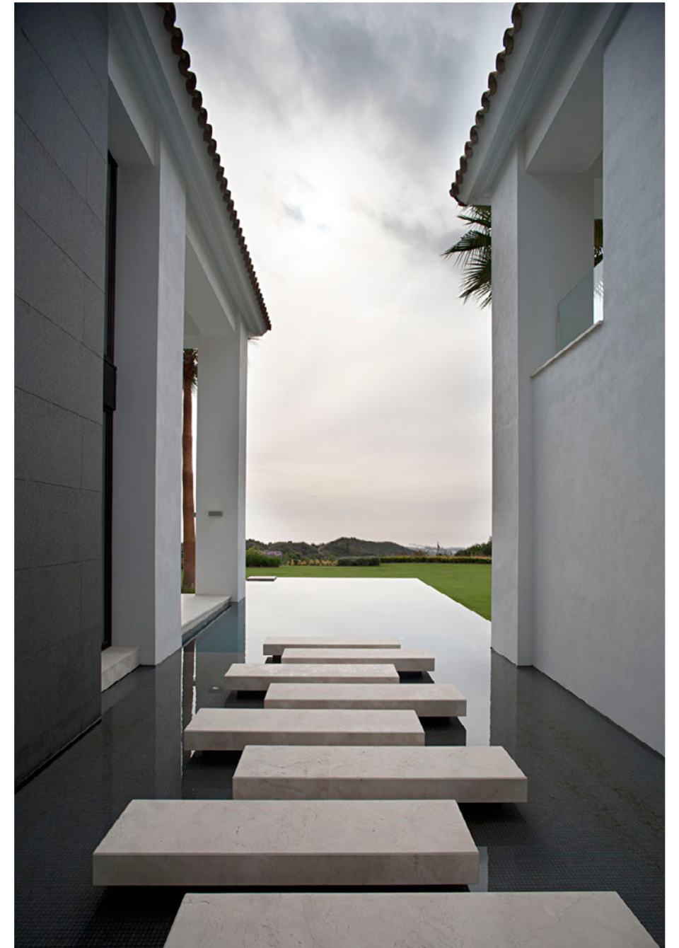
TINO VILLAS PORTFOLIO