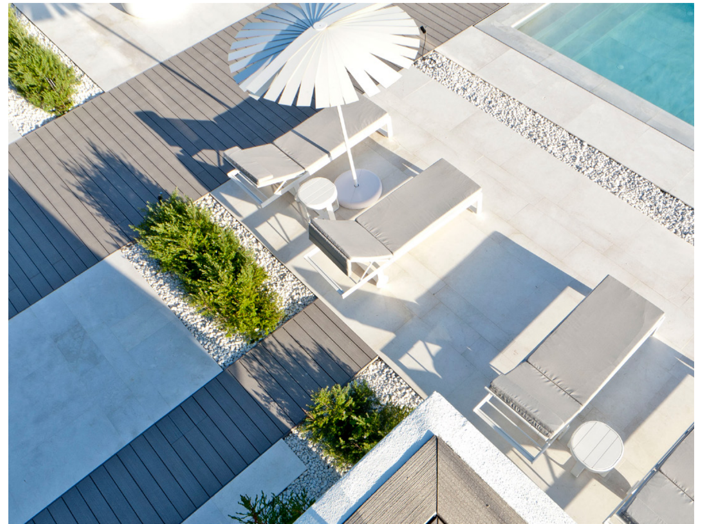
TINO VILLAS PORTFOLIO