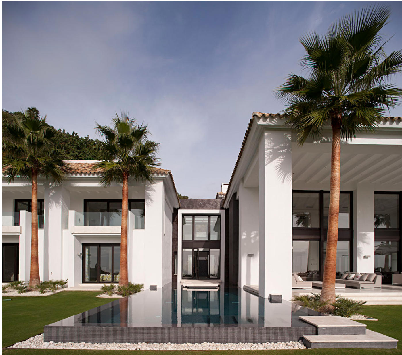
TINO VILLAS PORTFOLIO

Areas: Kitchen, Stairs, Living Room, Bathrooms and Exteriors