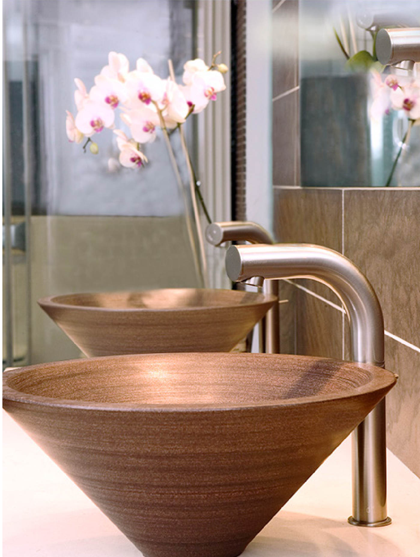
TINO VILLAS PORTFOLIO