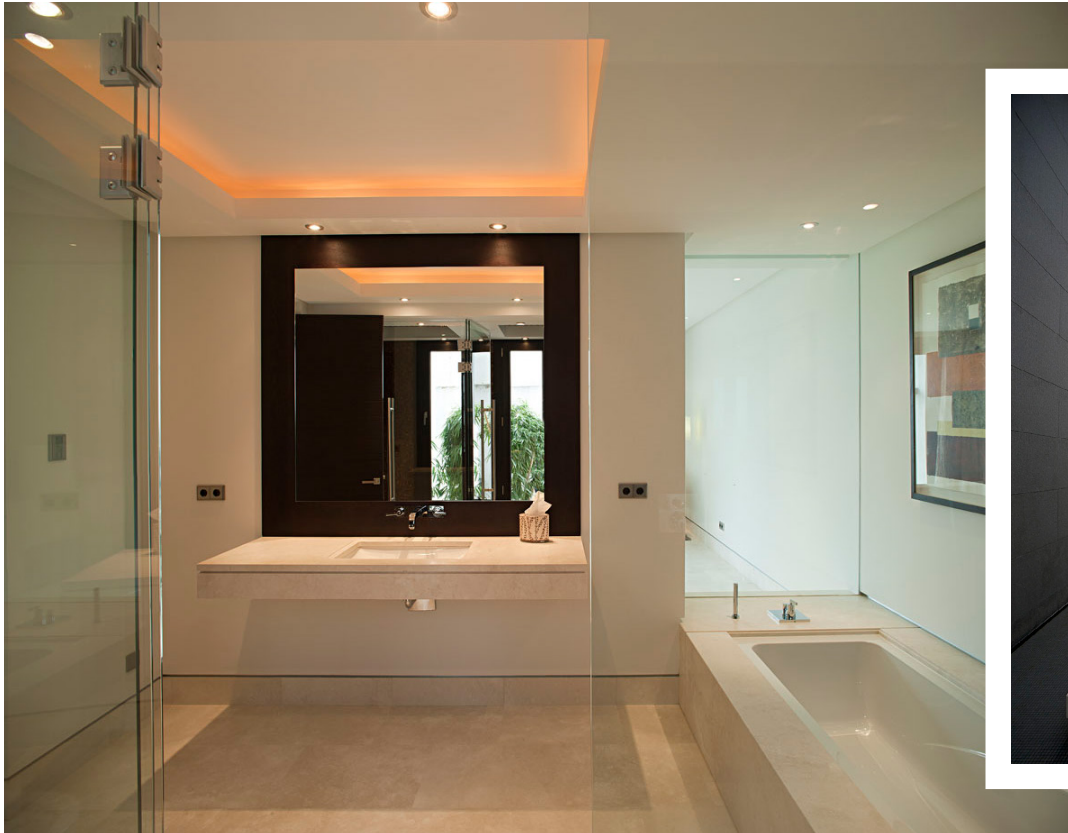
TINO VILLAS PORTFOLIO