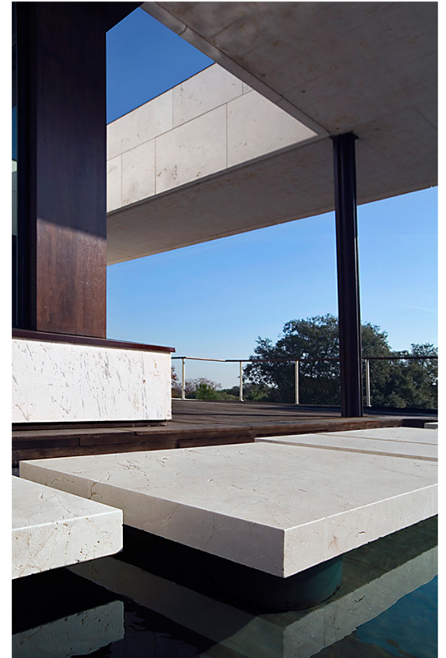
TINO VILLAS PORTFOLIO