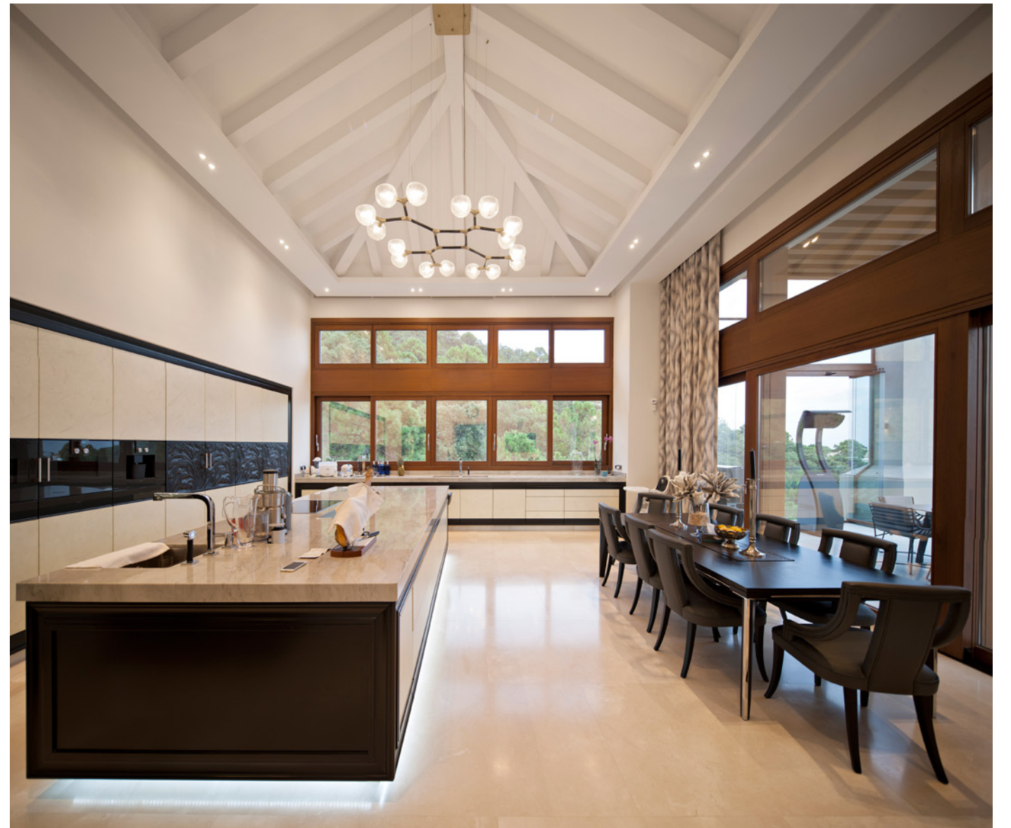
TINO VILLAS PORTFOLIO