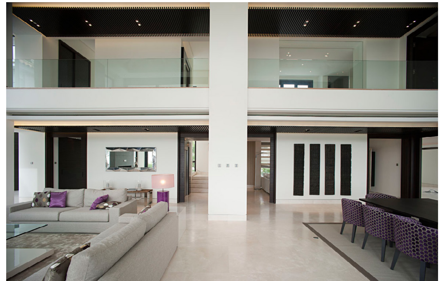
TINO VILLAS PORTFOLIO