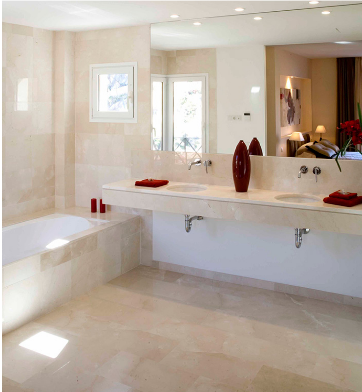
TINO VILLAS PORTFOLIO