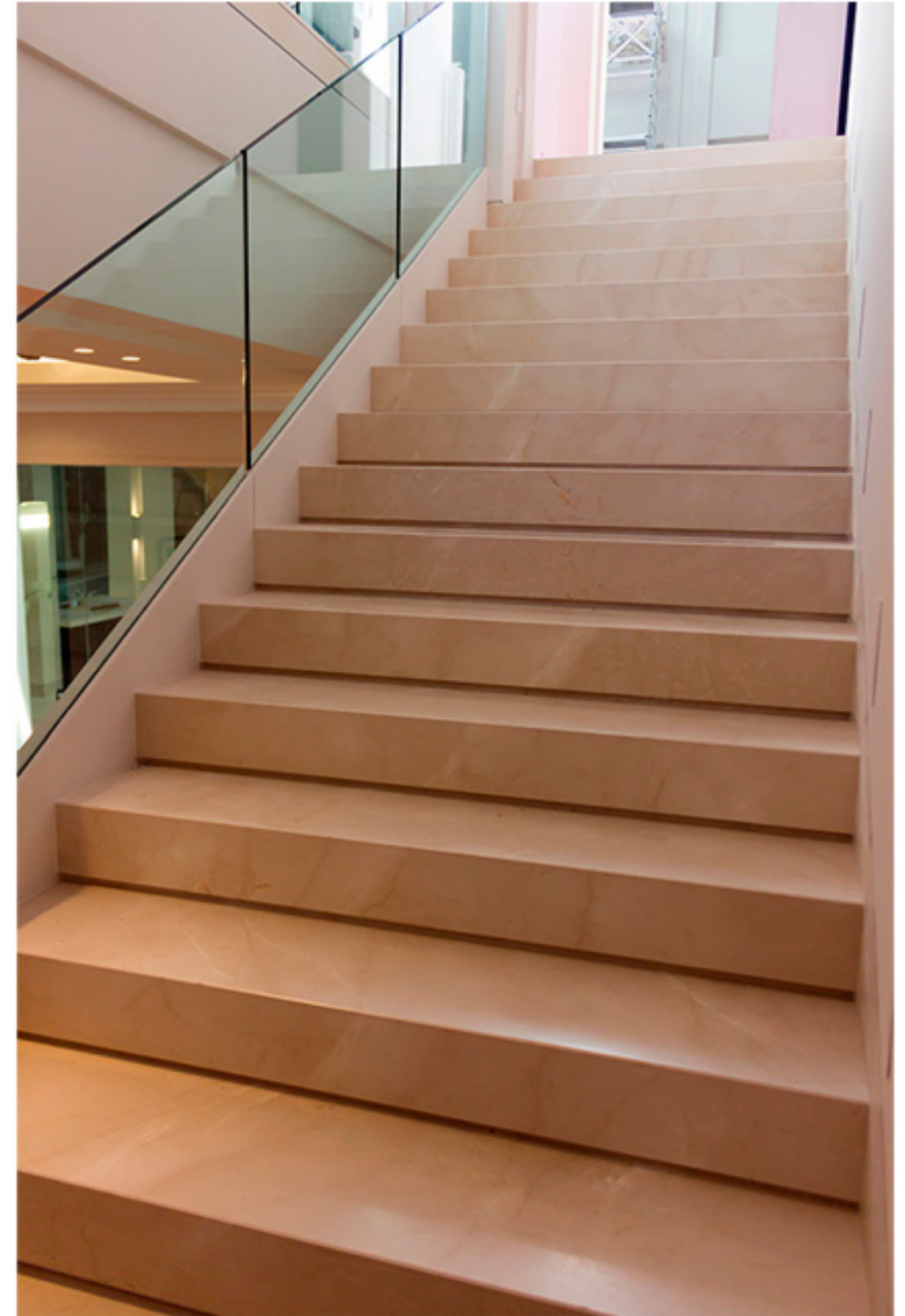
TINO VILLAS PORTFOLIO