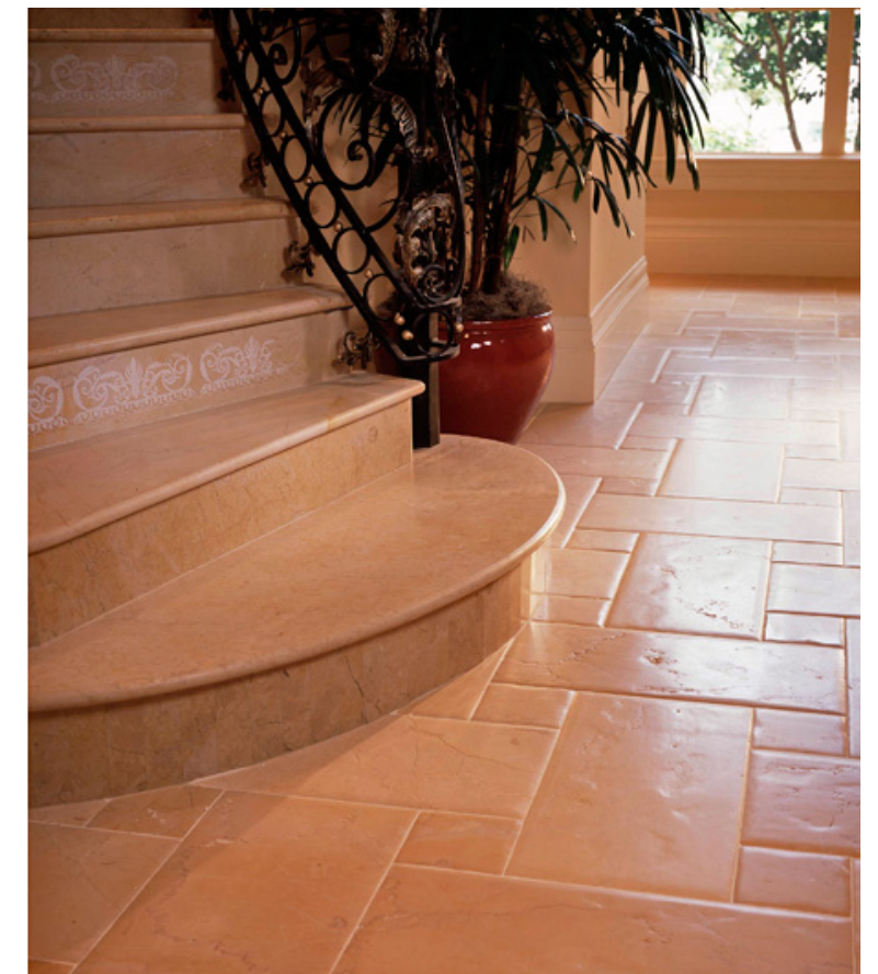
TINO VILLAS PORTFOLIO