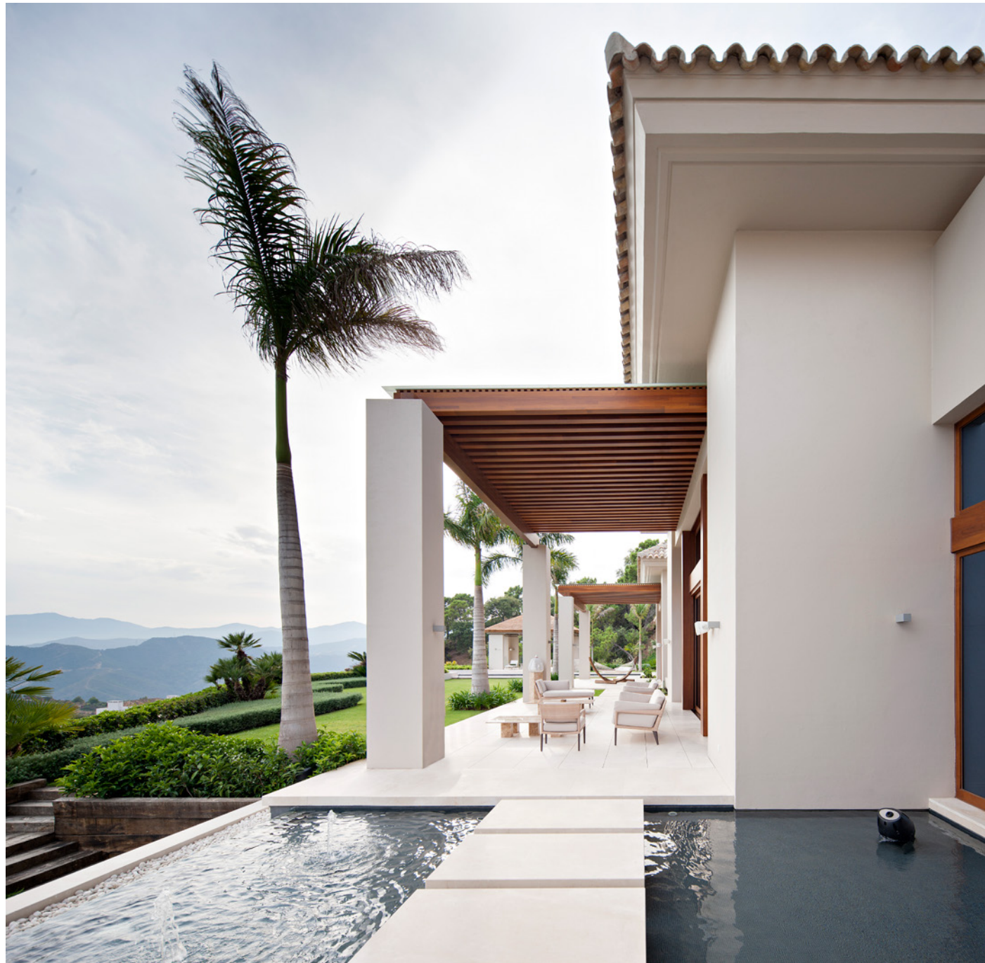
TINO VILLAS PORTFOLIO

Areas: Interiors, Exteriors, Entrance Hall, Facade, Pool, Living Room, Kitchen, Bathrooms, Spa, Turkish Bathrooms and Shower.