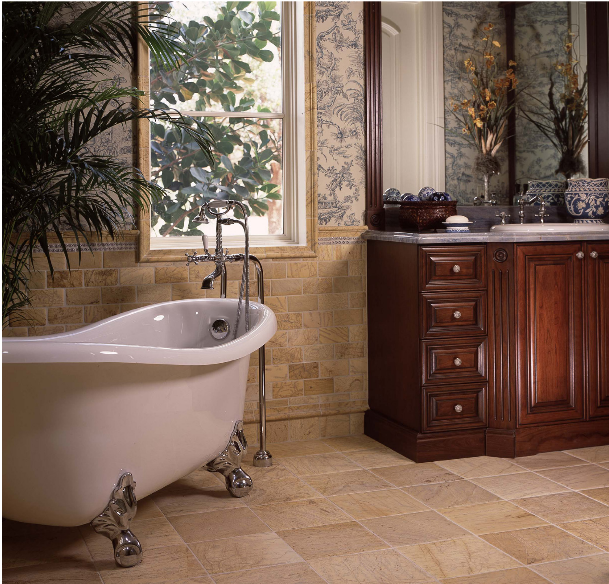
TINO VILLAS PORTFOLIO