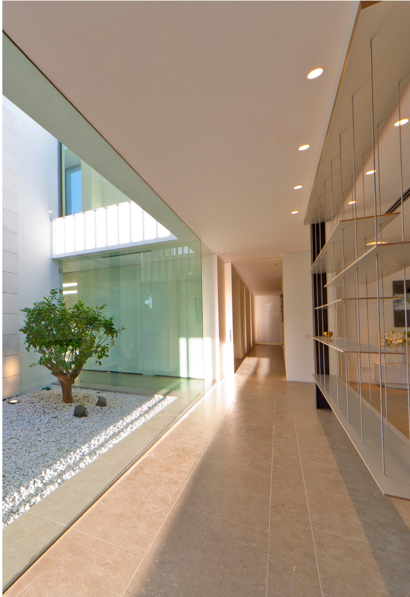
TINO VILLAS PORTFOLIO