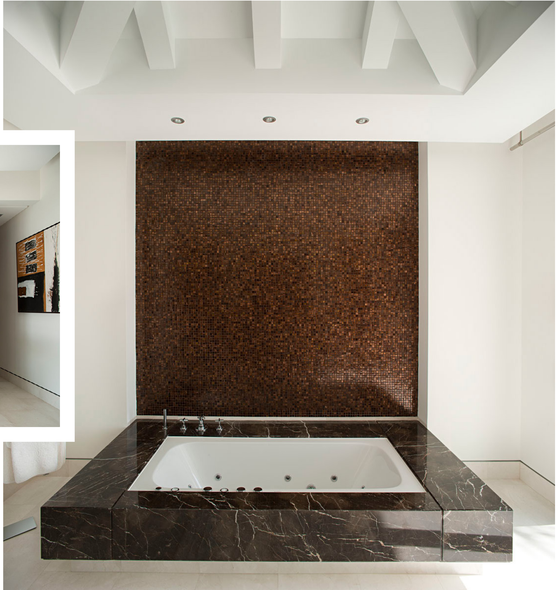
TINO VILLAS PORTFOLIO